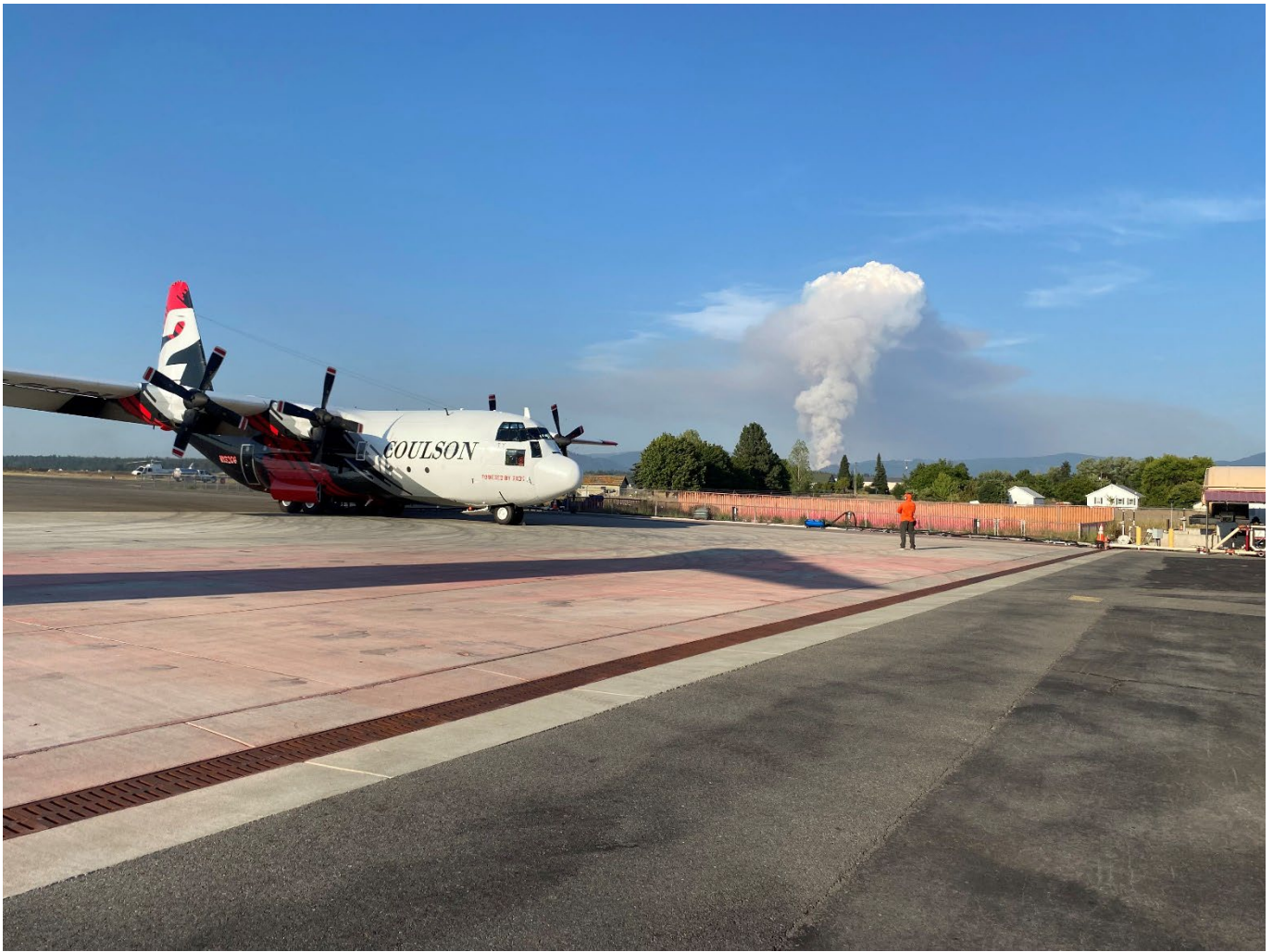
Smoke plume rising from the Ridge Creek Fire.